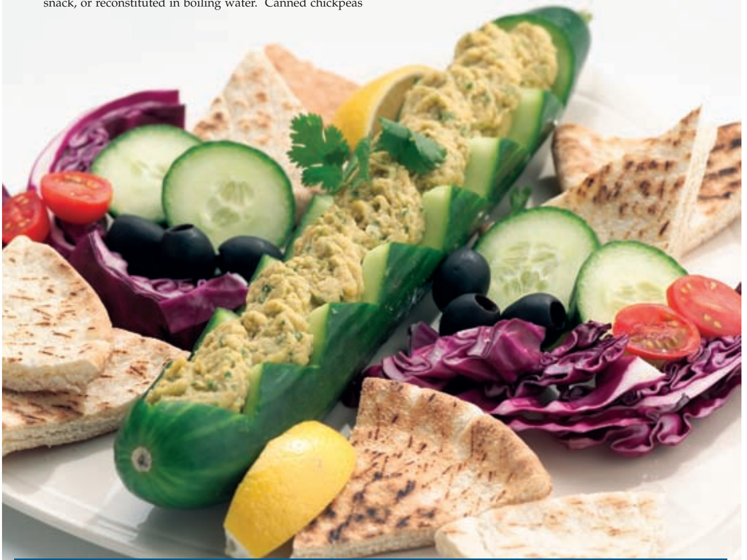
By Katie Beck

are a great staple item to keep in the pantry. Add to salads, soups and stews to boost protein levels and add a complex, nutty flavor. Most often used in middle-eastern cuisine, chickpeas can be pureed into a paste called hummus, which is a deliciously healthy spread traditionally complimented by cucumber, olives, red cabbage, tomatoes and pita bread. To create a visually appealing presentation of hummus, cut the top of a cucumber off and hollow out the inside with a spoon to make a "boat" for the chickpea spread. Serve with the traditional accoutrements and toasted pita triangles.