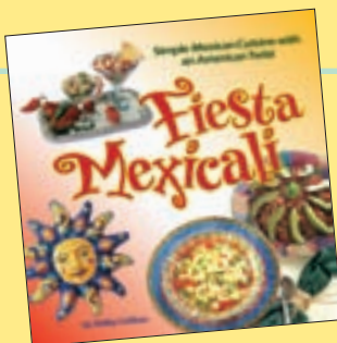
Fiesta Mexicali , by Kelley Cleary Coffeen, is available at area booksellers and at Amazon.com

Sauté the onions, garlic, and green chile in the olive oil in a skillet, over medium heat until the onion is clear and soft, about 4 to 6 minutes. Add the tomatoes, broth, chicken and lime juice. Bring to a boil, reduce to a simmer, and cook uncovered for 10 minutes. Serve in individual bowls and garnish with tortilla chips, avocado, green onions and lime wedges.